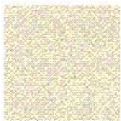
Summer Suede #2320