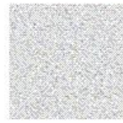
Winter White #2110