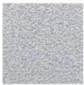
Steel Grey #2190