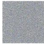
Rustic Grey #2160