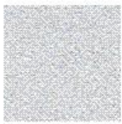
Minimal White #2310