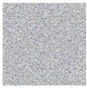
Dover Sky #2250