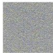
Putty Grey #2230