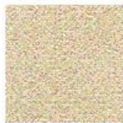
Sunset Yellow #2200