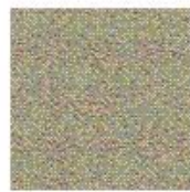
Sable Wood #2340