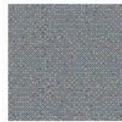
Silver Blue #2300