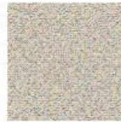
Sentry White #2030