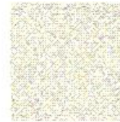
Natural Silk #2060