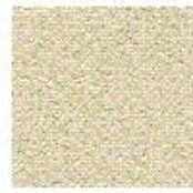
Pina Colada #2270