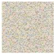
Taupe Sand #2080