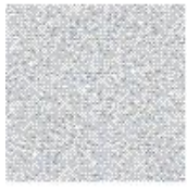
Snow Drift #2130