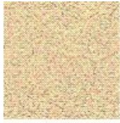
Ceramic Clay #2010