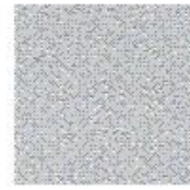
Soft Grey #2170