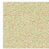
Morning Mist #2210