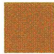
Sand Drift #2350