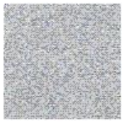
Wedge Wood #2070