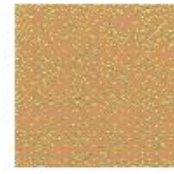
Cameo Cream #2180