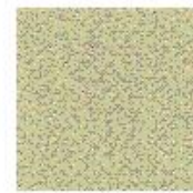
Beach Sand #2240