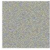
Grey Kitten #2140