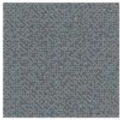
Cannon Grey #2260