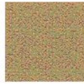
Sandal Wood #2150