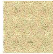
Vanilla Cream #2040