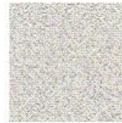
Panda White #2050