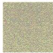
Sand Stone #2220