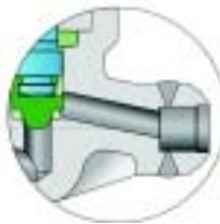
Butt-welding ends (BW)