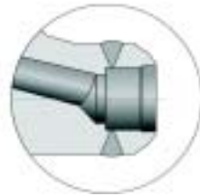
Butt-Welding Ends (BW)